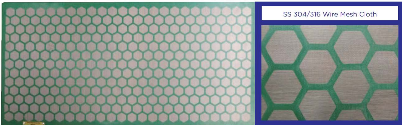
Steel Frame (Positive Side)