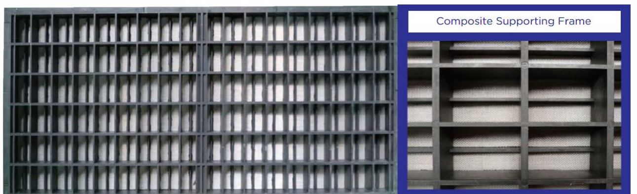
PT Frame (Reverse Side)

https://www.topshakerscreen.com/ Email:postmaster@topshakerscreen.com