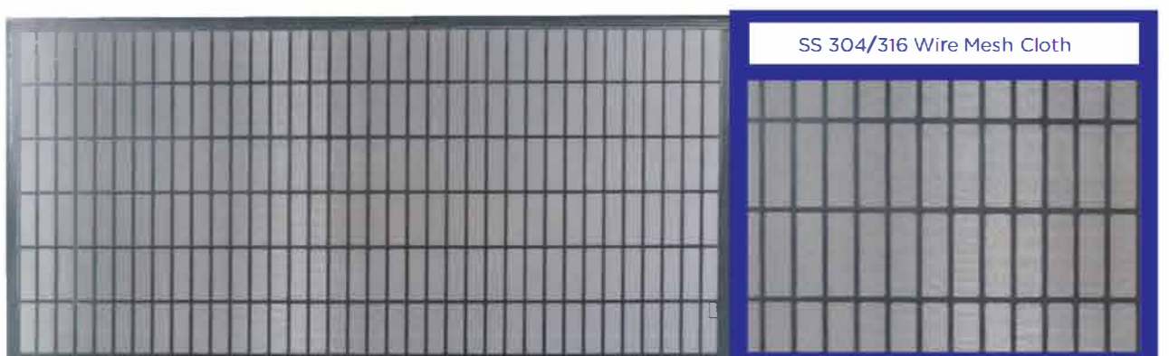
PT Frame (Positive Side)